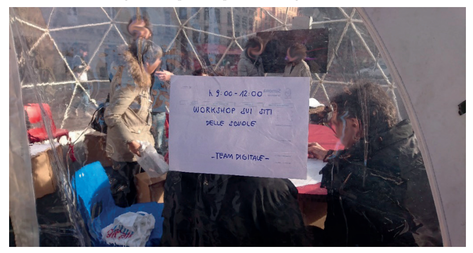
Figure 7. Paper and pencil in a digital bubble.

The first thing that surprised us, in this sense, was to notice how often technological practices were not at all so simple and unproblematic: on many occasions, workshops have been delayed a lot for trivial technical problems (wi-fi repeatedly down, projectors on automatic stand-by and speakers unable to restart them, sound-check more difficult than expected, etc.). In addition, the calendar of appointments had been loaded on the platform eventbrite.it in order to manage the reservation of the available seats: in some cases, this loading was done incorrectly, as some booked events did not correspond, for times and places, to those actually realized. The "timetable revisions", then, were communicated using (very analogic) paper and pen (Figure 7).