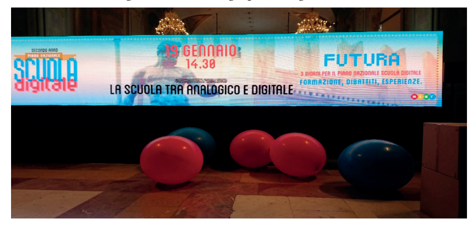
Figure 4. From analogic past to digital future.

the innovative spaces for teaching «are not purely technological environments, but rich, creative and immersive ateliers». They «bring the outside world into the classroom and allow the emphasis to shift from the reproduction of knowledge to its construction». Creativity is enough to make them recycle furniture from old houses and differentiated seats, building them on their own or, where necessary, involving the parents of the pupils in different ways of sharing or financing ( fieldnotes ).