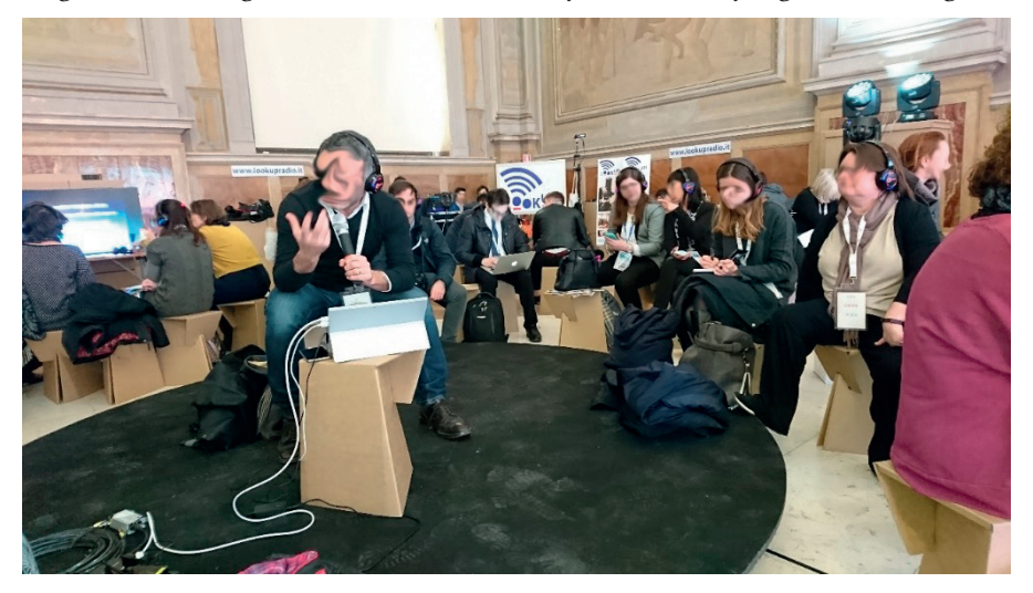
Figure 5. All is digital: we are here, but always mediated by digital technologies.

In Figure 5, we choose to show a kind of "digital silent party", during which also a real in-site workshop is digitalized: a wi-fi headphones system allows participants to hear the speaker and virtualizes all the possible interactions. We can see that digital introduces a virtuous mechanism of change, improvement and problems solving. It is the result of the «thirsts for knowledge inherent in human nature» and, today, thanks to Moore's Law, we can say that innovation, not only in electronics, but in through all our lives, is "exponential". It grows vertiginously, from day to day, taking us where we would never have imagined we could arrive, allowing us to