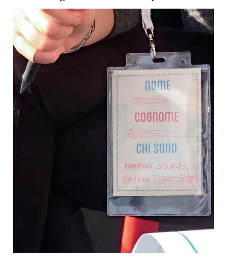
Figure 8. Who are you?