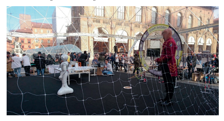
Figure 6. Technologies to be tamed: the robot circus.

The first thing that surprised us, in this sense, was to notice how often technological practices were not at all so simple and unproblematic: on many occasions, workshops have been delayed a lot for trivial technical problems (wi-fi repeatedly down, projectors on automatic stand-by and speakers unable to restart them, sound-check more difficult than expected, etc.). In addition, the calendar of appointments had been loaded on the platform eventbrite.it in order to manage the reservation of the available seats: in some cases, this loading was done incorrectly, as some booked events did not correspond, for times and places, to those actually realized. The "timetable revisions", then, were communicated using (very analogic) paper and pen (Figure 7).