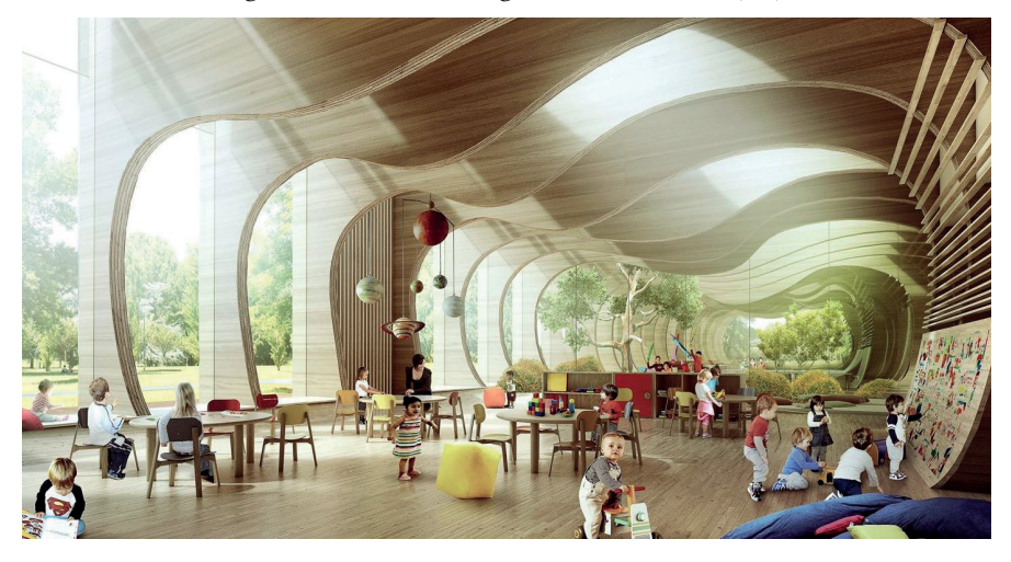
Figure 3. Whale Kindergarten in Guastalla (RE).

The rethinking of the school space and, more in general, the attempt of re-spatializing education, is traced through the exemplification of some projects of so-called "excellence", such as his " Asilo Balena " (Whale Kindergarten), built in Guastalla (RE) after the earthquake of 2012. As Image 3 clearly shows, it is a space consisting of the parallel succession of fifty lamellar structural frames conceived like the "Pinocchio whale". Each portal is shaped with harmonic forms that recall the internal anatomy of the great cetacean and determines the architectural rhythm both inside and outside, prolonging it on the front. The teaching spaces are interrupted by rest areas and by the winter garden and the rooms are perceived continuously, thanks to the flooring that rises up to lean against the sinuous shapes of the portals. In the "kindergarten" everything communicates with the outside, thanks to the large windows that collect light, becoming the occasion for sensorial experiences.